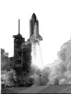
NCFI polyurethane insulates the space shuttle’s fuel tank.

substrates and expand in place allow spray foam to seal cracks and crevasses. Stopping air infiltration is one of spray polyurethane foam’s greatest assets.